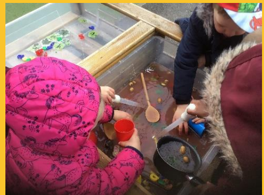
The Little Harriers making potions in the water!