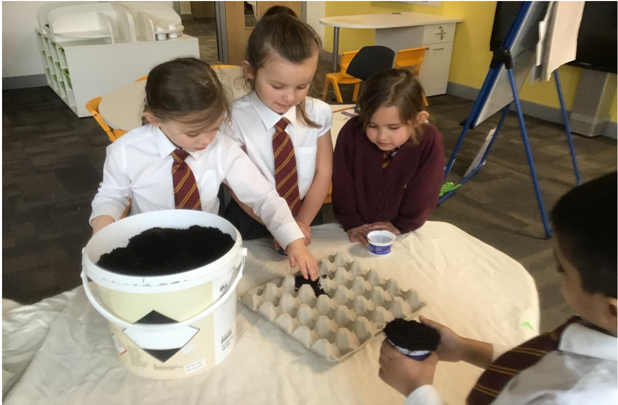
Here we are filling the trays!