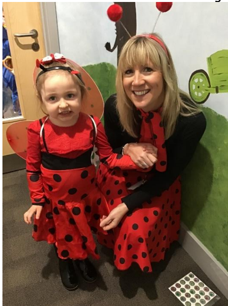
Picture 1 - Two Ladybirds from the 'What the Ladybird Heard'. Mrs Hopkins had wing envy!