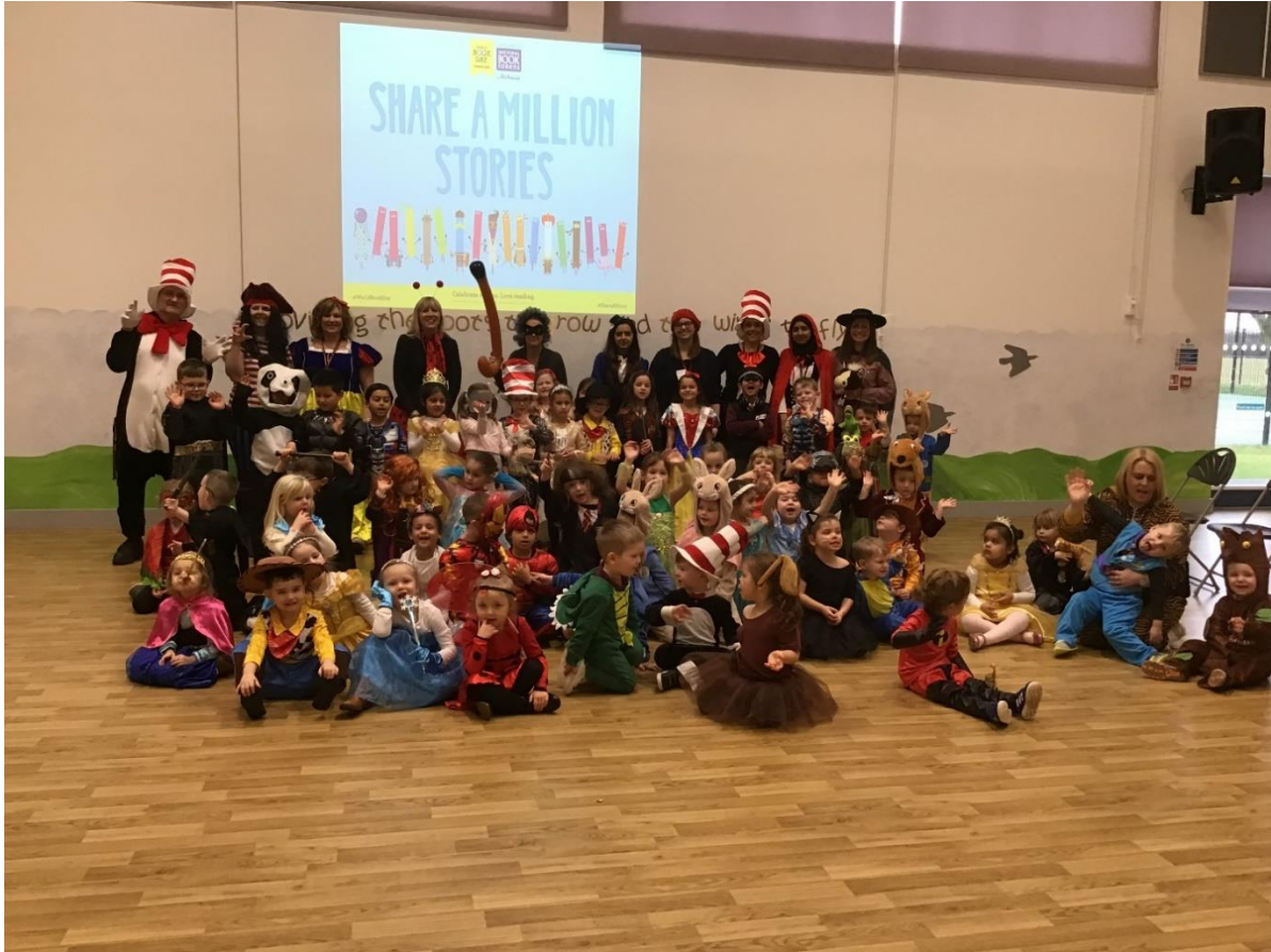
Here we all are! Dressed to impress! Happy World Book Day! Gangster Granny is looking a bit dangerous with that walking stick!