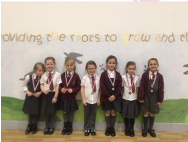
Year One Gymnastics Team