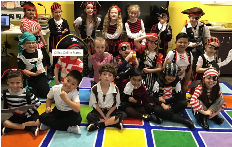
A very fierce looking Year 2 Pirate Crew!